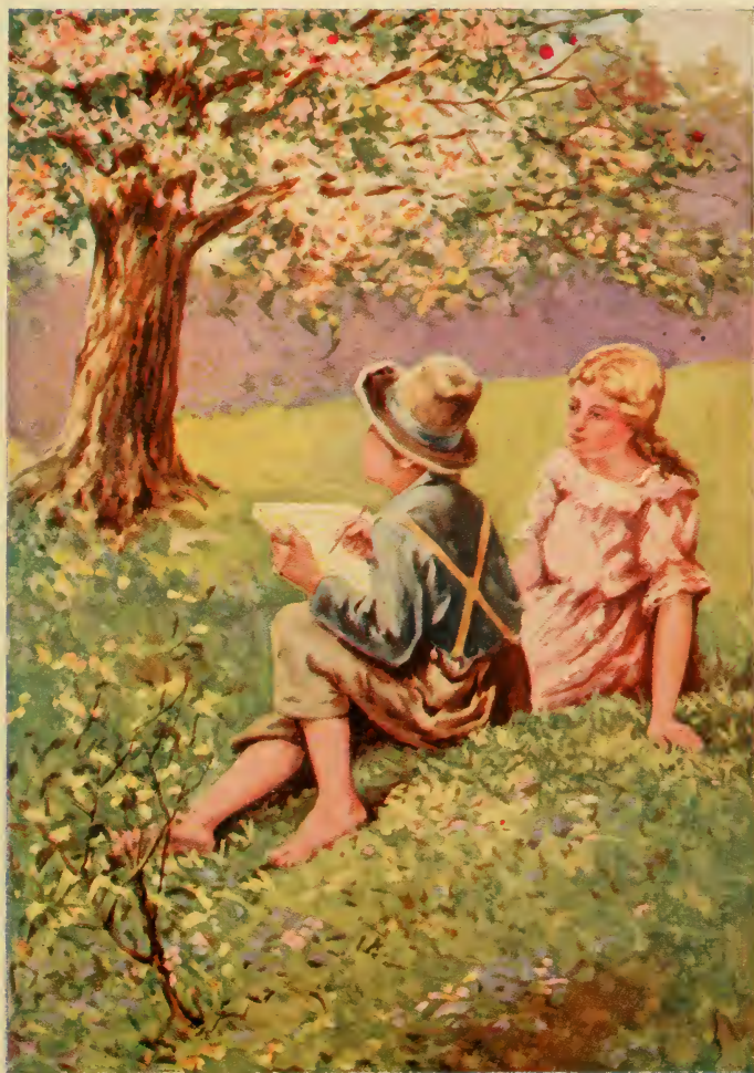
EMMA WATCHED EVERY STROKE WITH SILENT INTENTNESS